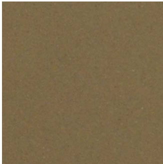
Formulation based on Syntran 1657