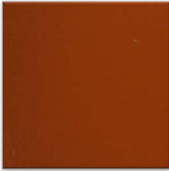
Formulation based on Syntran 1657