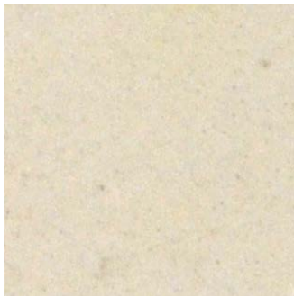
Formulation based on Syntran 1657