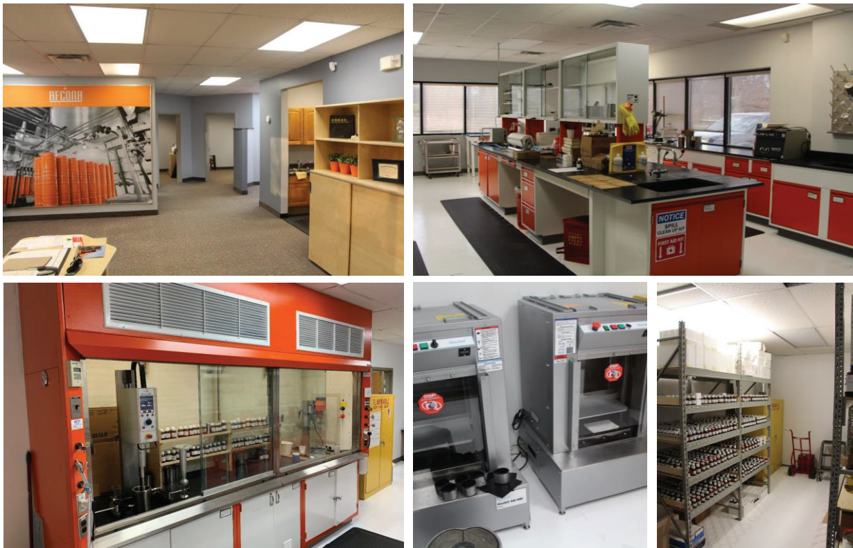
AFCONA USA office and technical service lab in Hudson, Ohio

Finally, at AFCONA, we believe that our single most important asset is our customer. We strive to fully understand our customer's needs and service them. Only our customer's success will allow us to excel.